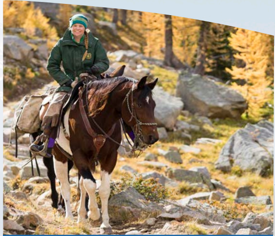
Okanogan-Wenatchee National Forest, Washington